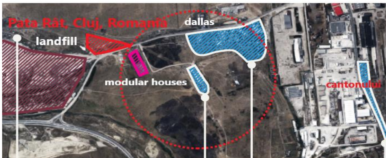
Map 2. Map of the Pata Rât area including Cantonului, modular houses, Dallas, and the landfill

Today, the Pata Rât area is home to around 1,500 Roma, victims of institutional racism, and development policies that exploit the cheap labor of the most vulnerable while excluding them from the resources of a decent living.